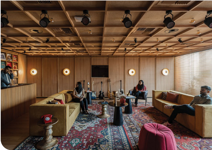
DAS Audio Event-26A line array with Event-115A subs delivers intelligibility and musical headroom for townhall briefings and live showcases with Q-SYS Core 8 Flex enabling dual-mode programming, allowing the space to toggle between quiet playback and live jam sessions with a single tap

dio. Each space is meticulously acoustically treated to ensure speech remains clear, performances stay contained, and work zones remain undisturbed.