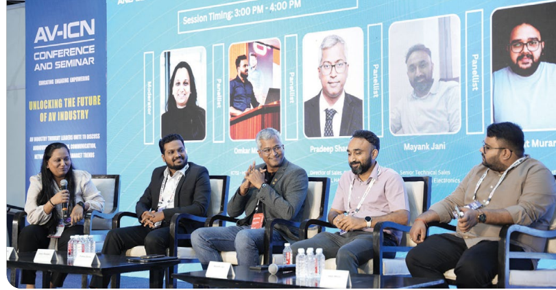
Conference Session held at AV-ICN Expo 2025 discussing "Revolutionising AV: The Impact of AV over IP and 5G on Modern AV Systems"

This year's showcase reflects a noticeable shift in industry momentum, with a strong emphasis on visual display technologies