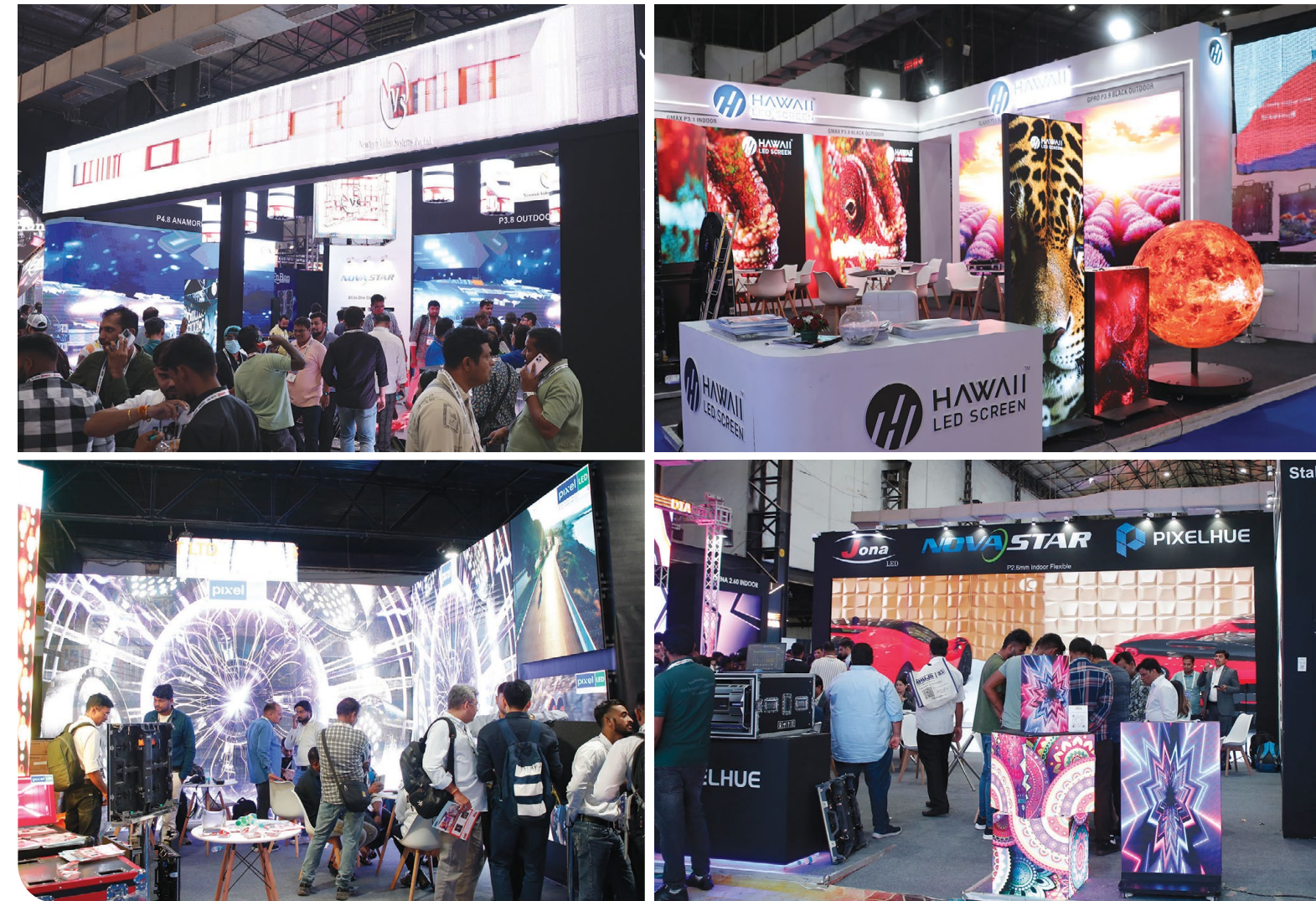
From the AV-ICN Expo 2025 show floor: Showcasing pro AV technologies and solutions at one of India's leading AV exhibits

— RAMESH CHETWANI, Show Director, PALM AV-ICN Expo