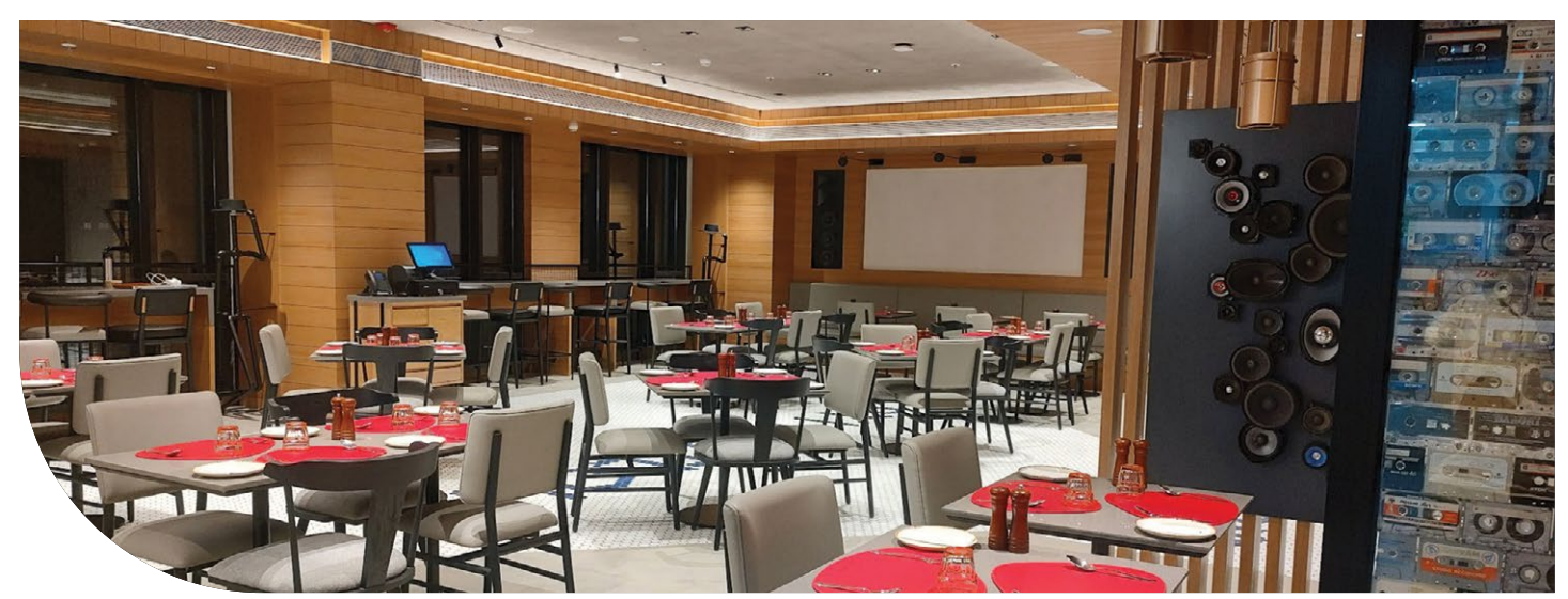
HARMAN deploys outstanding JBL solutions at Moxy Hotels restaurant to outgrow every visitor's experience with immersive audio