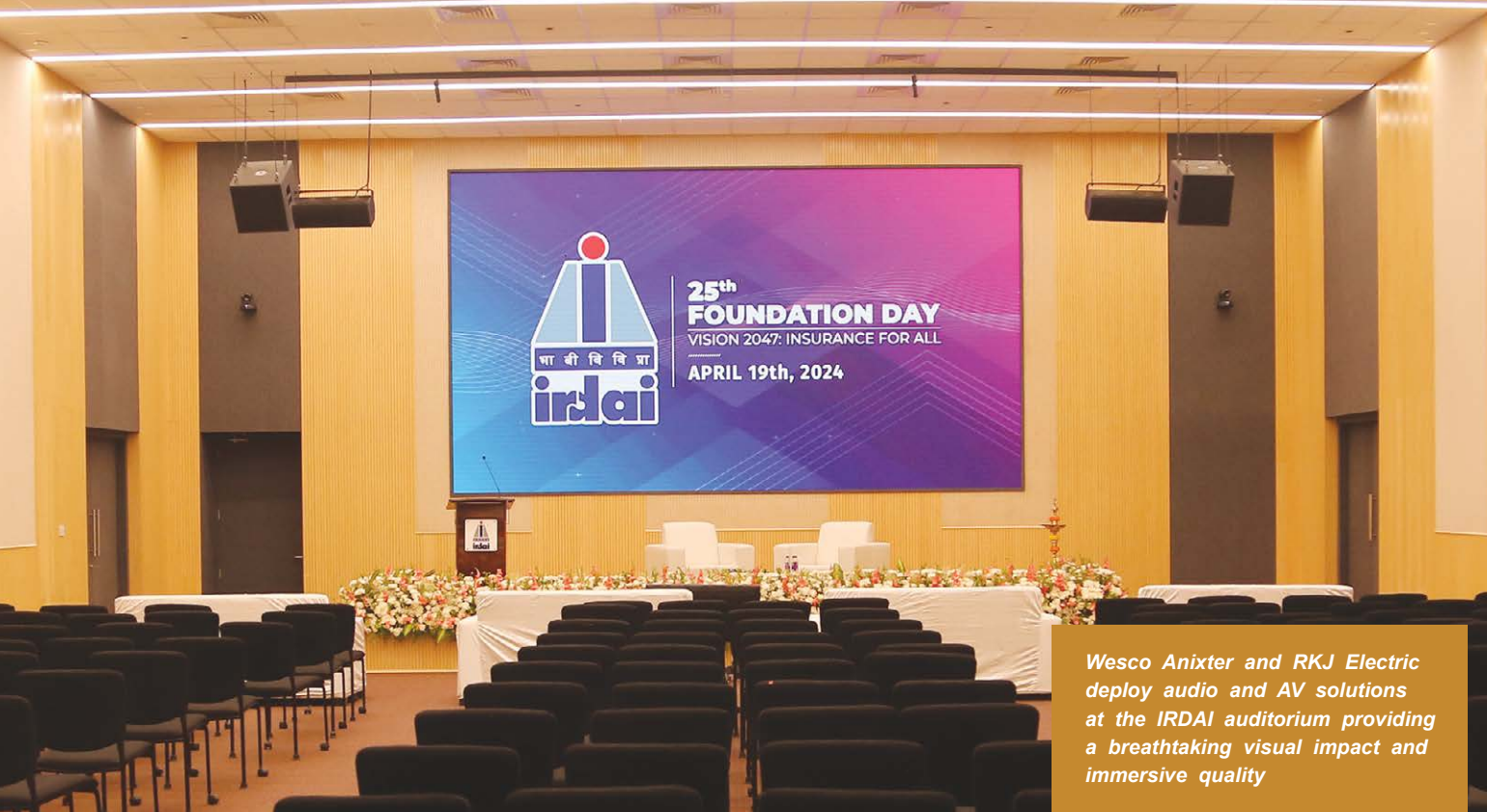
Wesco Anixter and RKJ Electric deploy audio and AV solutions at the IRDAI auditorium providing a breathtaking visual impact and immersive quality

ments to accessibility features, sustainability measures, and aesthetics, creating a welcoming and inclusive environment for all participants. With these upgrades, the IRDAI auditorium reaffirms its role as a premier venue for industry gatherings, seminars, workshops, and conferences, fostering collaboration, innovation, and knowledge sharing within the insurance community.