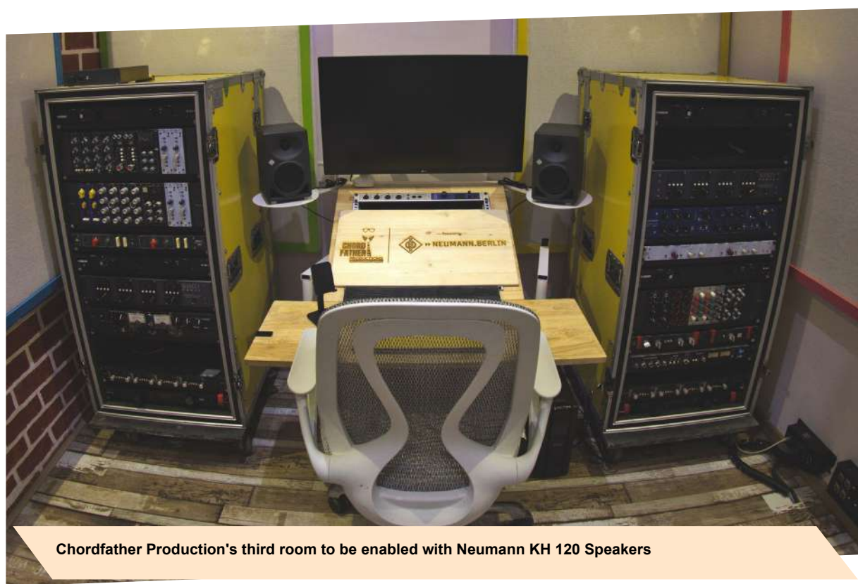
Chordfather Production's third room to be enabled with Neumann KH 120 Speakers