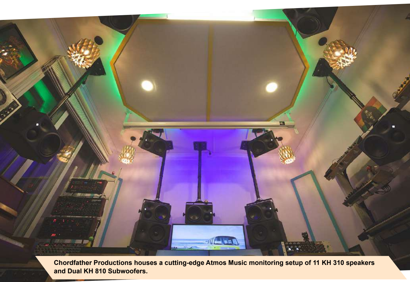
Chordfather Productions houses a cutting-edge Atmos Music monitoring setup of 11 KH 310 speakers and Dual KH 810 Subwoofers.