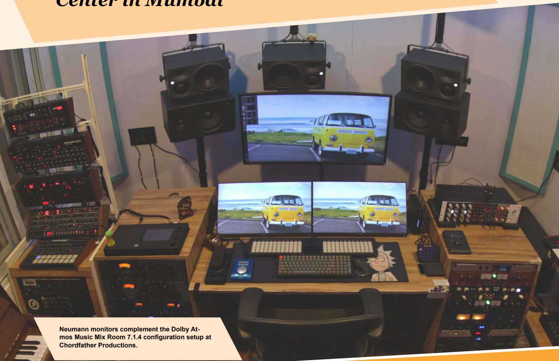
Neumann monitors complement the Dolby Atmos Music Mix Room 7.1.4 configuration setup at Chordfather Productions.